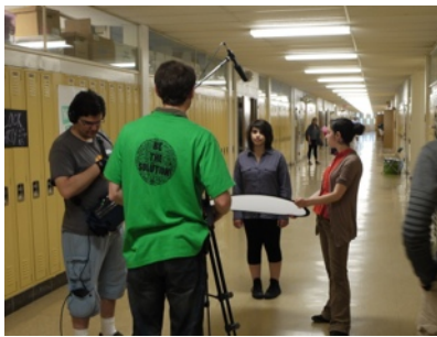
"Be the Solution" features FPS students