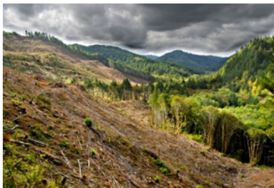
Deforestation causes irreversible consequences