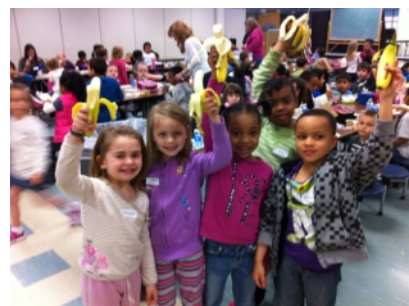
Fresh food provides better health AND waste-free alternatives

With the films completed, we are now collaborating with schools throughout Michigan to help implement sustainability initiatives, such as recycling and promote environmental stewardship via PLP films and presentations. Launching environmental programs is complicated and each school faces different obstacles. While some districts simply do not offer recycling, others may have no recycling bins for kids to deposit materials. There is no "cookie cutter" approach when it comes to sustainability and that's why PLP offers programs tailored to meet each school's specific needs.