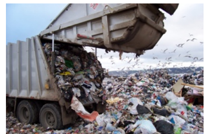
Lets redefine "trash" as valuable resources

It is essential to build on existing knowledge and recycling seems to be a terrific starting point. After our last "Cafeteria Trash Sort" at an elementary school with over 765 kids, this "single focus" concept was imperative. Even though recycling is a relatively familiar term, differentiating between materials is complicated. Thanks to my friend Bonnie who challenged me to define "trash" I had an epiphany. The recyclable materials such as plastic, aluminum, glass, paper, and cardboard are valuable resources that can be used over and over again. When I see a piece of paper I think of a tree. When I see reams of paper I think of a forest and the precious biodiversity it supports. By recycling we prevent the need to extract raw minerals and in essence, "save the planet" and natural resources for future generations. Recycling is a fundamental behavior that most people can participate in at home and at school. So let's embrace 2014 with new awareness towards protecting Earth's resources. We can start by appreciating the numerous valuable materials we commonly use and avoid items that cannot be recy-