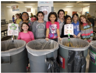
Green Team kids help peers learn to recycle

As the year comes to a close we would like to highlight Peace, Love & Planet's (PLP) accomplishments, discoveries and 2014 aspirations. PLP had a full calendar in 2013 connecting directly with over 4,700 Michigan students to promote conservation of Earth's resources by encouraging eco-friendly choices. We spent the beginning of the year launching our new "Cafeteria Trash Sort" program, conducting student focus groups and developing the exciting environmental film series " Be the Solution ". We are thrilled to be nationally recognized for "Be the Solution" which will be part of the Green Schools National Conference in Sacramento, CA in March 2014.