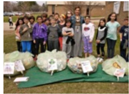
Examining trash to identify natural resources