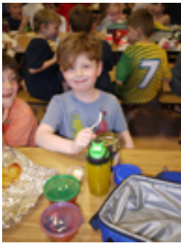
Reduce waste, reuse