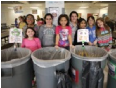
Green Teams help peers learn cafe recycling

Launching environmental programs is complicated and each school faces different obstacles. While some districts simply do not offer recycling, others experience confusion identifying acceptable materials. There is no “cookie cutter” approach when it comes to sustainability. Therefore, PLP tailors programs to meet each schools specific needs. By engaging and supporting student lead initiatives we empower young leaders who understand the fragility of our planet to take action for positive change.