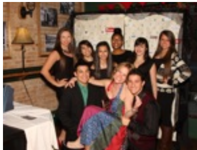
Cast of “Be the Solution” at PLP Benefit